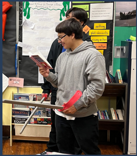
The Anchor Issue 9 Volume 9