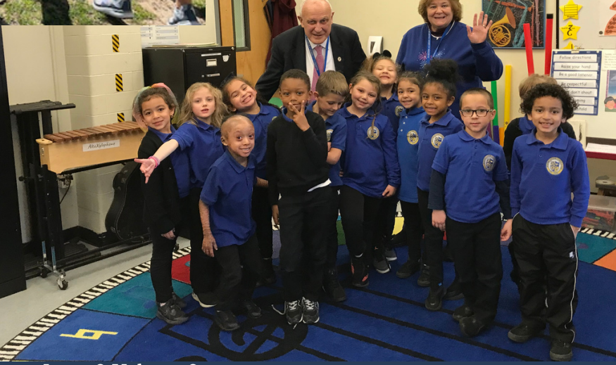
The Anchor Issue 9 Volume 9