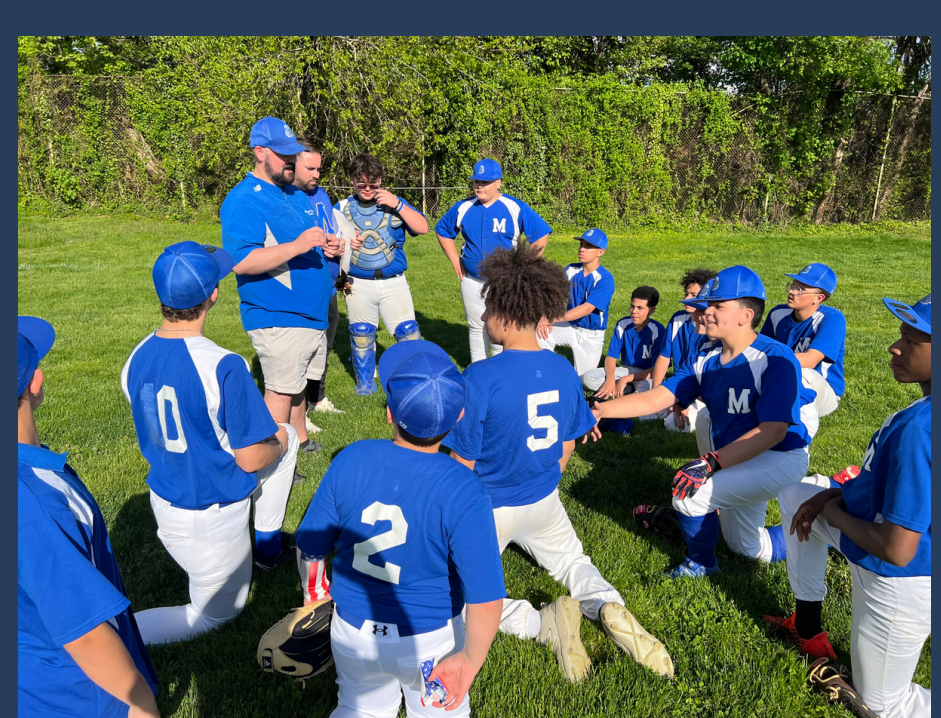
Middle School Baseball